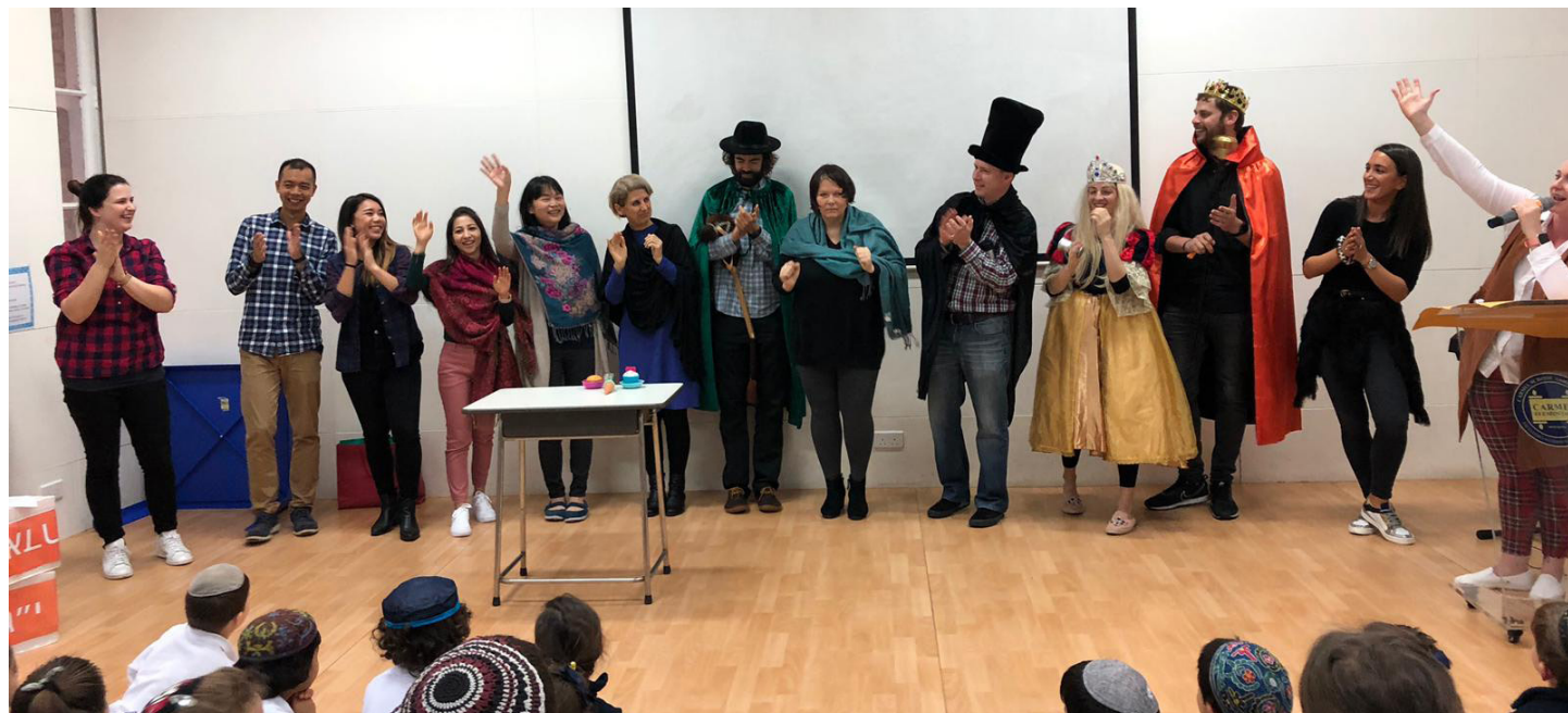
The Carmel Elementary staff put on a short 'Purim Shpiel' this morning during assembly. The children enjoyed their lively performance!